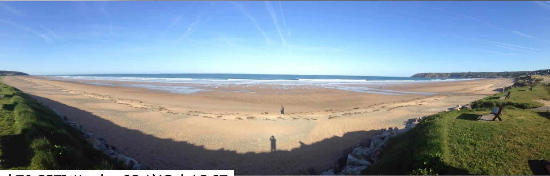
LES PIEUX - Le GRAND LARGE